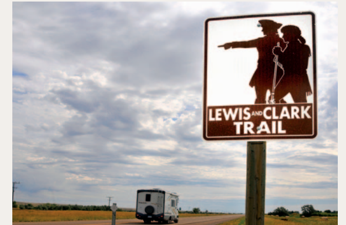
A Lewis and Clark Trail highway sign along U.S. Highway 2