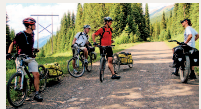
Adventure cyclists on the Great Divide Mountain Bike Route meet near the Canada-U.S. border.