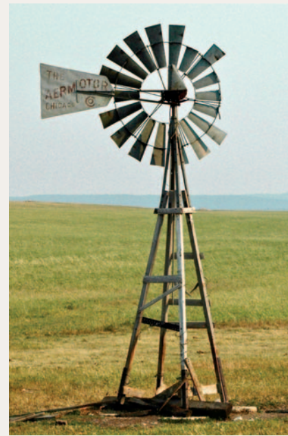
Old wind pump on a ranch near Hobson.

Wind pumps were used mainly in Montana from the 1880s to 1930s. The number declined as rural electrification programs extended power lines to farms and ranches to run electric-powered water pumps. Some ranches still use wind pumps to supply water for livestock in remote areas where stringing a power line is too expensive.