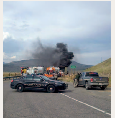
Montana Highway Patrol and Park County sheriffs and firefighters respond to a truck fire on I-90 near Livingston.

Another enforcement officer you might spot is an FWP game warden . Wardens are responsible for enforcing hunting, fishing, and boating regulations and helping with the stewardship of Montana's fisheries, wildlife populations, state parks, and other types of outdoor recreation.