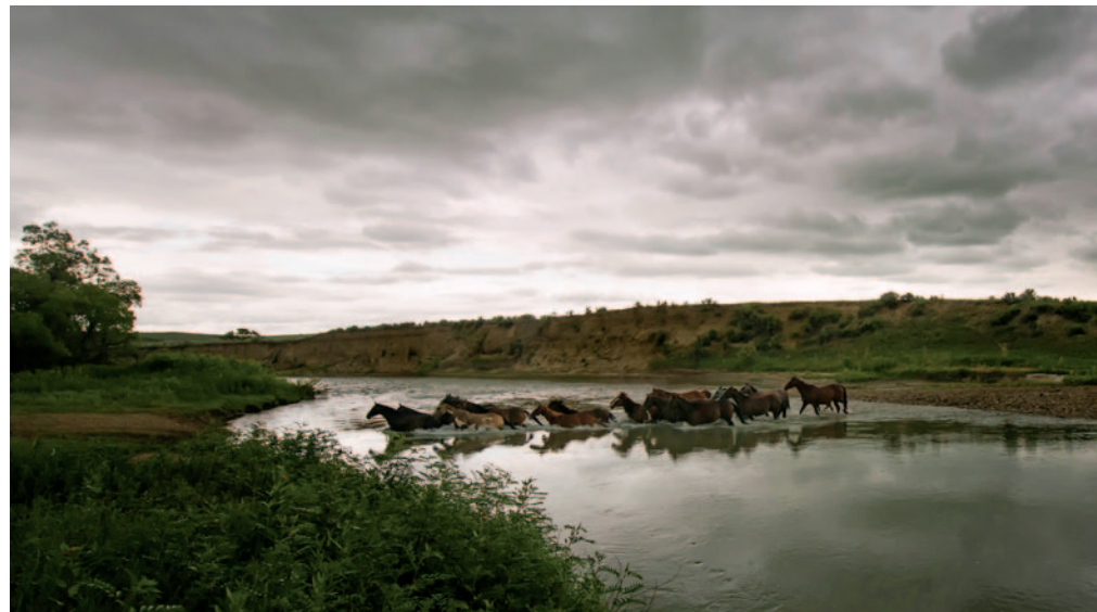
Above: A herd of horses crosses the Little Bighorn River on the Crow Indian Reservation.

Other reservation revenue comes from tourism, arts, food services, timber harvest, transportation, construction, manufacturing, and utilities.