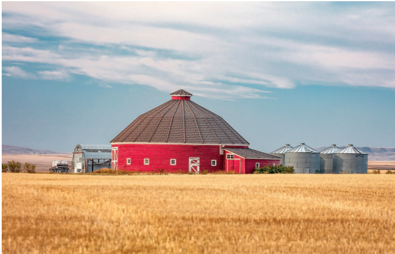
A round barn south of Brady, Teton County. Built mainly for dairy operations, round barns often contain a central silo around which cattle feed on silage. The circular structures are rare in Montana, where farmers favor square and rectangular barns that are easier to build and wire for electricity.