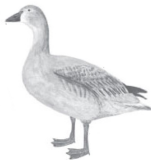
Immature Snow Goose