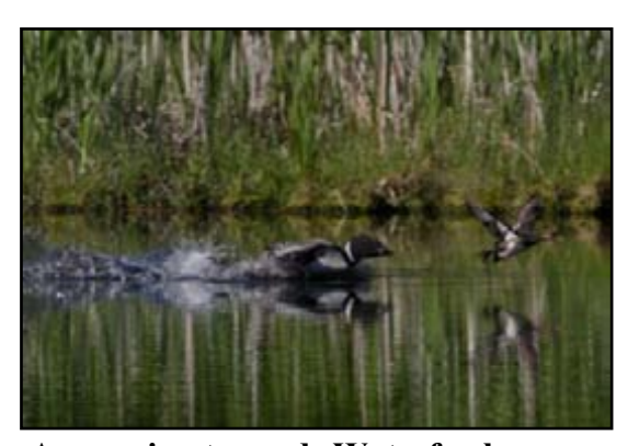
Aggression towards Waterfowl