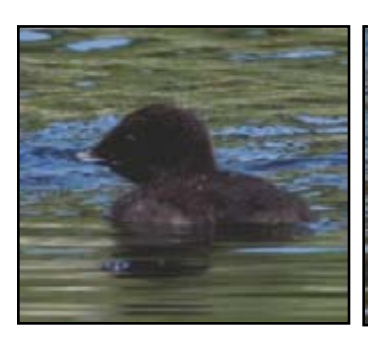
STAGE 1 - The chicks are small and have black to brown downy feathers with a white belly. They keep these downy feathers only from hatch for approximately 7 to 10 days. Chicks in this stage are often observed on the backs of adults.