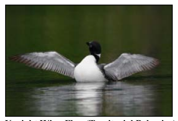
Upright Wing Flap (Territorial Behavior)