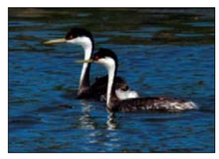
Western Grebe Similarity: general shape, red eye Distinguishing: white neck/cheek