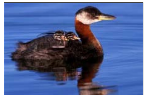
Red-necked Grebe Similarity: tremolo, general shape, chicks ride on back Distinguishing: red neck, white cheek, small size