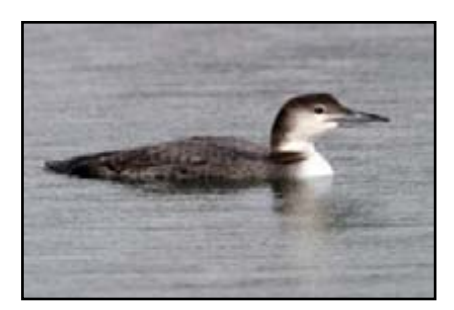
Common Loon in Winter Plumage