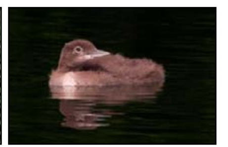
STAGE 3 - At about 4 weeks of age, the brownish (reddish) gray downy feathers start being replaced by smoother gray contour feathers. By the end of this stage, at about 9 weeks old, the chicks have completely replaced their down feathers with smooth gray contour feathers.