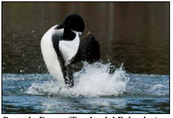
Penguin Dance (Territorial Behavior)