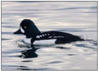
Barrow's Goldeneye (male)