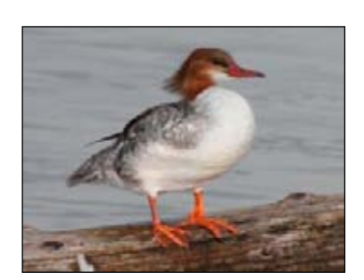
Common Merganser (female)

Distinguishing: thin, bright orange bill