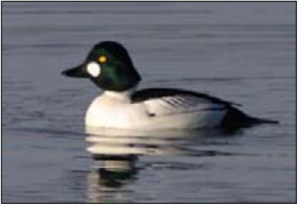
Common Goldeneye (male)

Similarity: black head and overall coloration in males Distinguishing: white patch on face, duck-like shape, short bill, small size