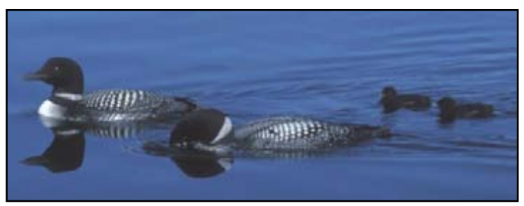
Common Loon Family with Two Stage One Chicks