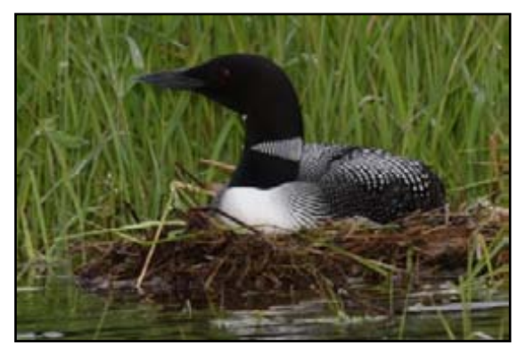
Common Loon on Nest (Summer Plumage)