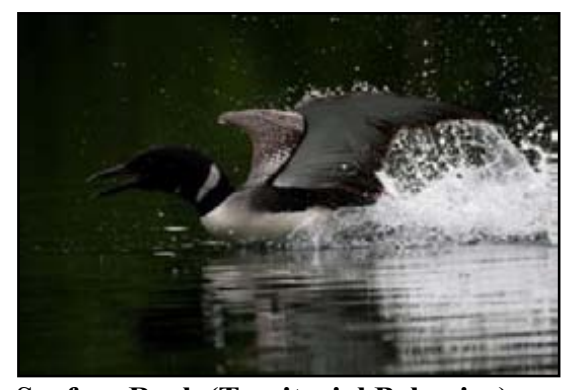
Surface Rush (Territorial Behavior)