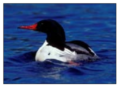
Common Merganser (male) Con Similarity: all black head and overall coloration

Distinguishing: thin, bright orange bill