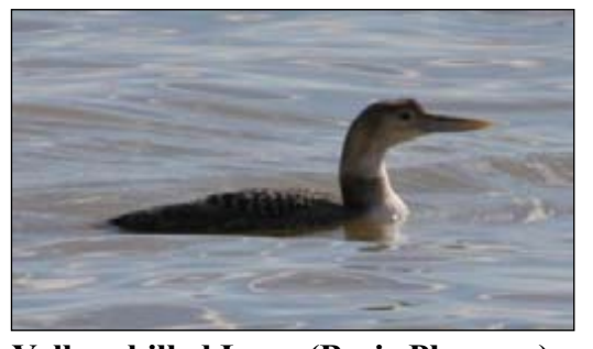
Yellow-billed Loon (Basic Plumage) Rarely observed in Montana Distinguishing: heavy pale to yellow bill that angles up