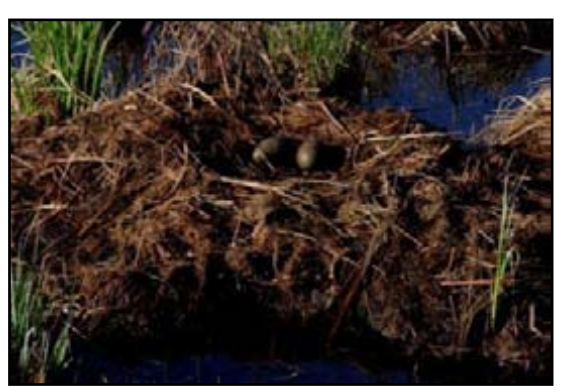
Common Loon Nest with Two Eggs