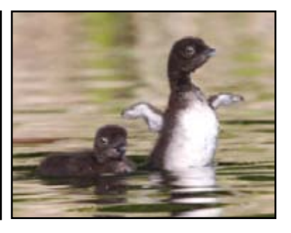
STAGE 2 - From 10 to 14 days old, the black downy feathers appear more brownish or reddishgray. The chicks keep these feathers until they are approximately 4 weeks old when they may start to appear unkempt.