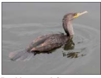
Double-crested Cormorant Similarity: size, long bill, neck shape Distinguishing: orange face and throat

Similarity: black head and overall coloration in males Distinguishing: white patch on face, duck-like shape, short bill, small size