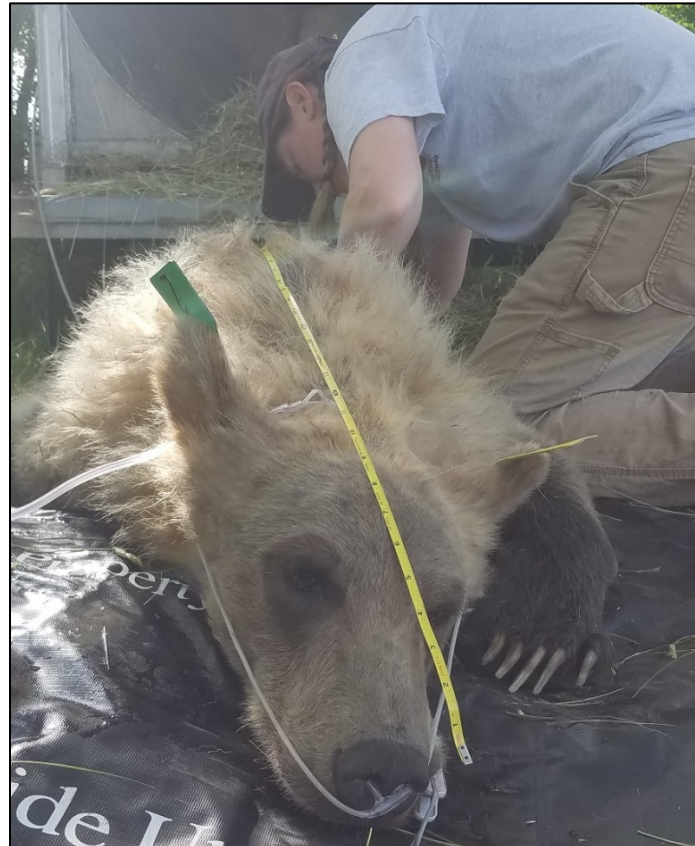
Figure 5: This subadult female was preemptively captured north of Conrad because she was frequenting areas close to residences, but not obtaining human food. She stayed away from people after the relocation to Blackleaf WMA.

Obtained approval and funding to initiate a research project testing if livestock guard dogs can keep grizzly bears out of commercial corn fields.