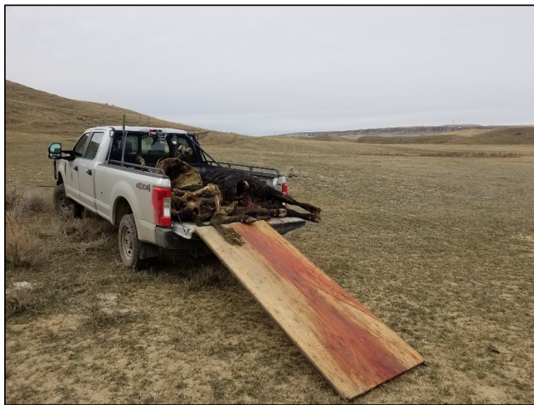
Figure 2: Removing a bone pile that was attracting a grizzly bear near residences and livestock. The carcass driver came on late in 2019 and thus we had to fulfill the need.