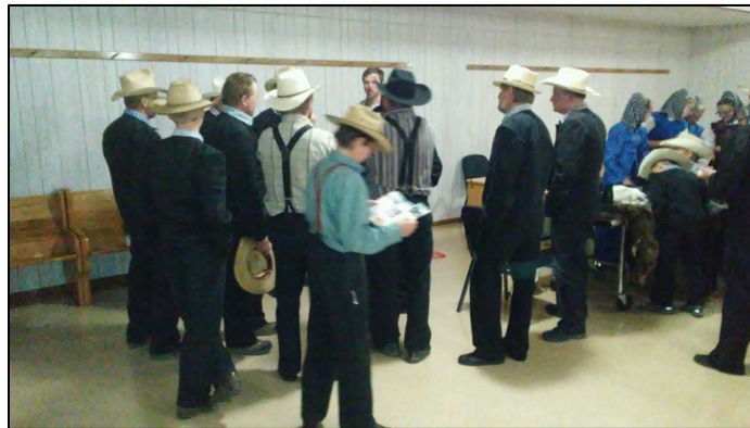
Figure 1: Grizzly bear outreach and education at Cascade Hutterite Colony.

Montana Fish, Wildlife, & Parks-Region 4 hired a new Bear Management Specialist and a Bear Technician to cover areas where grizzlies are expanding. These positions are based in Conrad and began at the end of July 2017. Below is a summary of efforts for the second full calendar year of this position (December 2018 through November 2019). Grizzly bears remain listed under the Endangered Species Act, despite being biologically recovered. Thus, final grizzly bear management decisions are under the authority of the United States Fish and Wildlife Service.