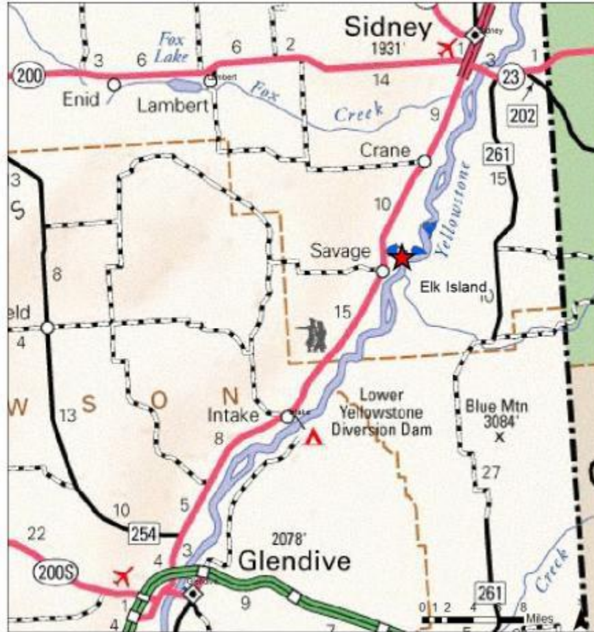
Figure 1. Elk Island WMA in eastern Montana is located near the town of Savage along the Yellowstone River in Richland County.

5. Project size: The project size is approximately 170 acres of farmland.