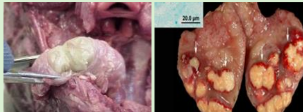
Abscessed lymph node