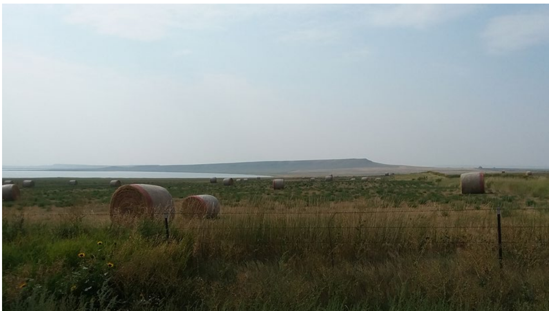
8-15-18. Photo depicting baled hay within are area targeted for haying on Big Lake WMA.

Hay cutting would benefit wildlife, specifically waterfowl, upland birds, and nongame species by maintaining upland habitat productivity. Periodically cutting select portions of these upland cover patches would create a diverse habitat age structure within the WMA. Grass litter would not be allowed to build up, extending long term productivity. Periodic haying would also increase the functional life of broadleaf species in these cover plots, such as alfalfa. The hayed areas would provide temporary foraging areas for upland bird chicks. After haying, second growth alfalfa would also provide a late summer forage source for mule deer and pronghorn.