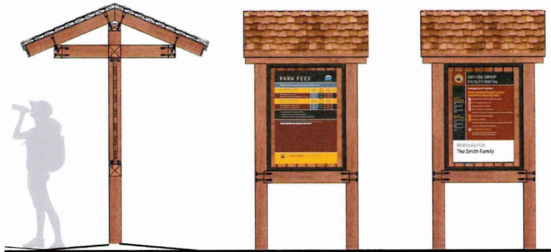
Image shown is one of several kiosk styles that will be bid.