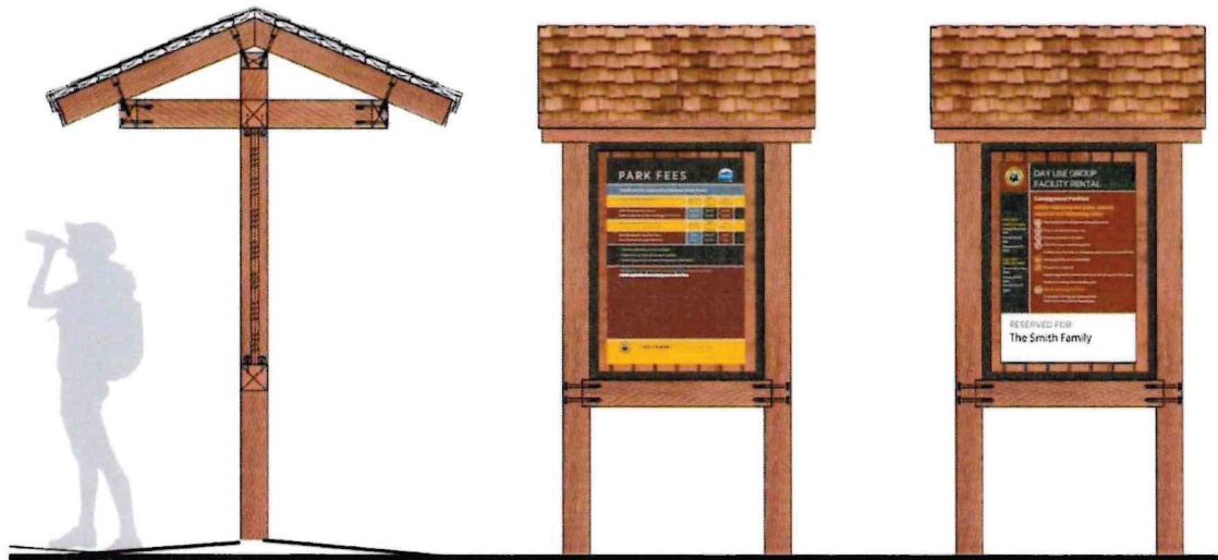
Image shown is one of several kiosk styles that will be bid.