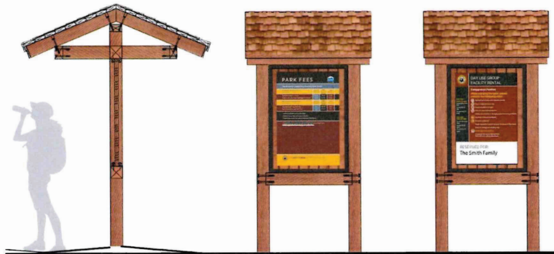
Image shown is one of several kiosk styles that will be bid.