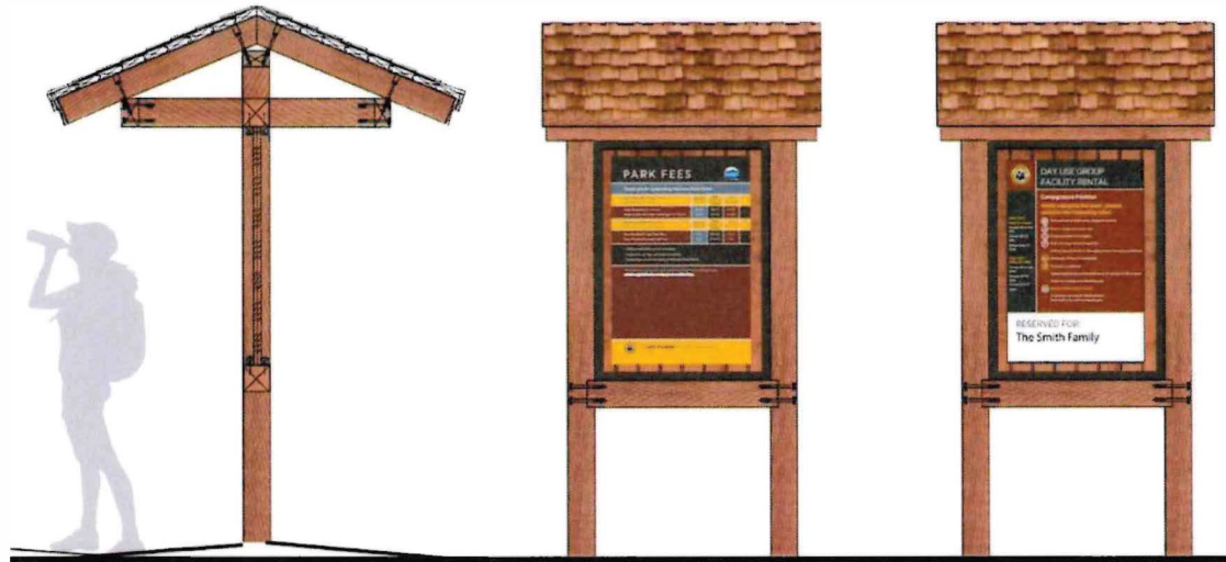
Image shown is one of several kiosk styles that will be bid.