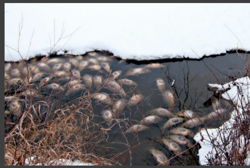
Winterkill on a shallow prairie pothole lake covered with thick snow.

Small, shallow lakes are the most vulnerable to winterkill