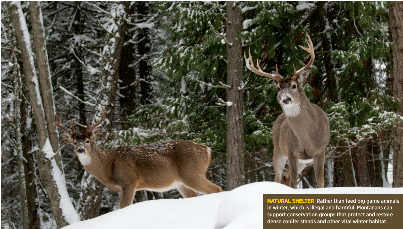
NATURAL SHELTER Rather than feed big game animals in winter, which is illegal and harmful, Montanans can support conservation groups that protect and restore dense conifer stands and other vital winter habitat.