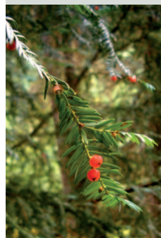
Native Pacific yew