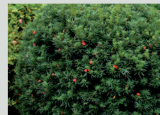
Ornamental Hick’s yew

Deer and other wildlife have no problems eating native Pacific yews found in northwestern Montana. But many non-native ornamental yews sold at nurseries, like the Japanese yew and the hybrid Hick’s yew—popular evergreen shrubs or trees with red berries and flattened, needlelike leaves—can be fatal to wildlife and pets. “Our Pacific yew is not toxic to deer, which is probably why they may be fooled into eating the introduced varieties that are,” says Rebecca Mowry, FWP wildlife biologist in Hamilton. “Deer and elk learn what to eat from their parents, and thus probably avoid anything unfamiliar. But a toxic plant that looks just like a ‘safe’ plant they’re accustomed to eating? That’s trouble.”