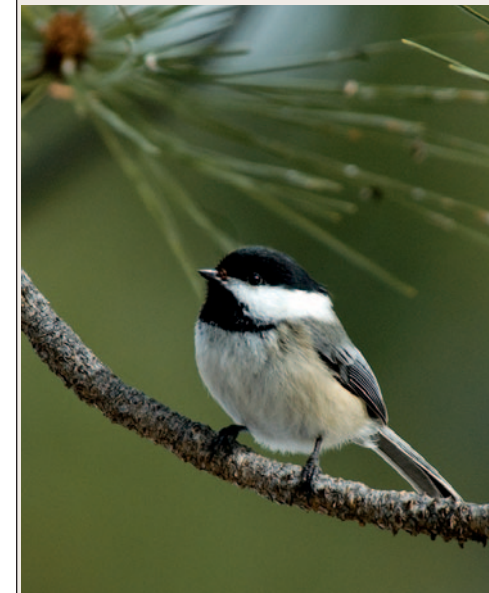
Black-capped chickadee in native habitat.

One way to help wild birds is to plant native shrubs, trees, and wildflowers that winged wildlife can use for food and shelter.