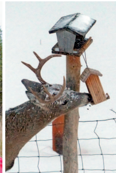
NEITHER WAY Some big game feeding is intentional, like setting out apples for deer. Some is accidental, like placing bird feeders where deer can get to the seeds and grains. But both can do lasting harm to the very animals that many people want to help during the cold winter months.

deer populations in Colorado and Wyoming have declined where CWD has been present for decades.