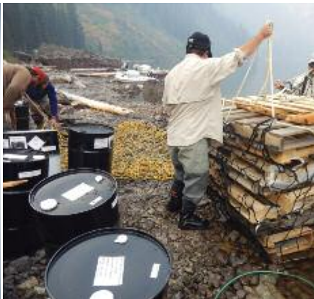
TAKING OUT THE WRONG FISH From left to right: A helicopter transports boats and supplies to Margaret Lake; unpacking barrels of rotenone used to kill an existing population of non-native fish; launching boats to carry rotenone onto Lena Lake for dispersal.