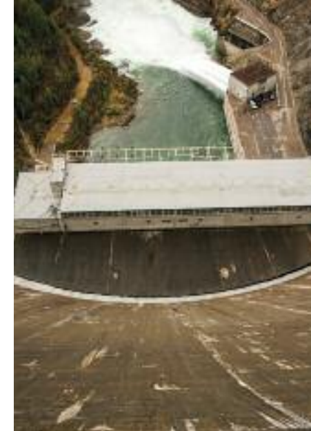
NO WAY PAST Though dams generally don’t help native fish species, Hungry Horse Dam actually protects the population upstream from hybridization with non-native rainbows downstream.

As for the rotenone, Marotz and Boyer explained that the chemicals in the plant-derived toxin are harmless to humans at levels used in the projects. They break down rapidly and kill only gill-breathing organisms (by preventing oxygen from crossing gill filaments). Because these include all fish