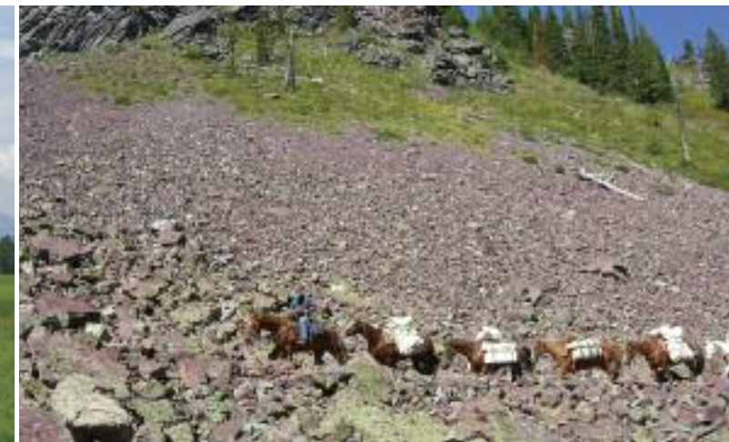
BRINGING IN THE RIGHT FISH Left: FWP workers load a helicopter bucket from a hatchery truck for stocking a backcountry lake. Above: Fish are transported via pack horses to Lena Lake.