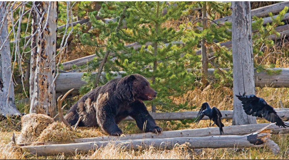
SHARING A grizzly lunges toward scavengers as it guards an elk carcass. In fall, as bears single-mindedly devour food to carry them through winter hibernation, they pay less attention to approaching hunters, increasing the risk of an accidental encounter.

every 10,000 hunters in the Yellowstone area phagia, a single-minded lust for have bear encounters, which, while they can calories in advance of their long scare the pants off people, usually end withwinter's sleep. When grizzlies find out injury. "You have a bigger chance of getfood, they can become so engrossed ting hurt in a car," he says. But he also calcuin eating they pay less attention to lated that of the 22 attacks near Yellowstone, their surroundings than usual. That's when a stealthy hunter could 72 percent of the victims were hunters. Frey says grizzlies usually move away from inadvertently stumble upon a bear.