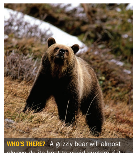
lways do its best to avoid hunters if it can smell or hear them approaching.

Crowley, of South Dakota, and Heimer, her Montana guide, saw the female bear from about 60 feet away and three cubs 100