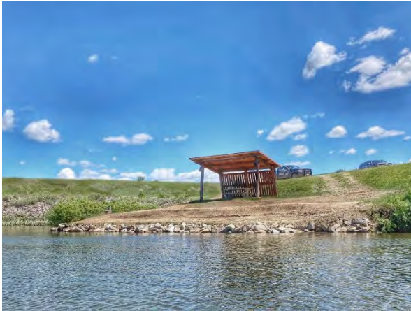
Above: Big Casino Reservoir