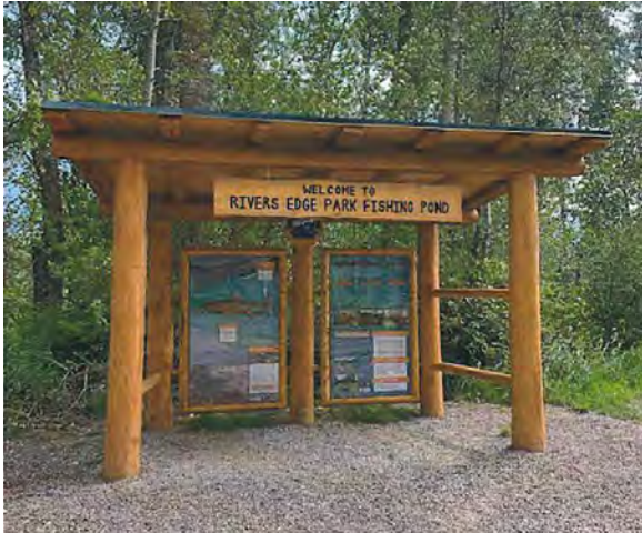
Above: Rivers Edge Park Pond