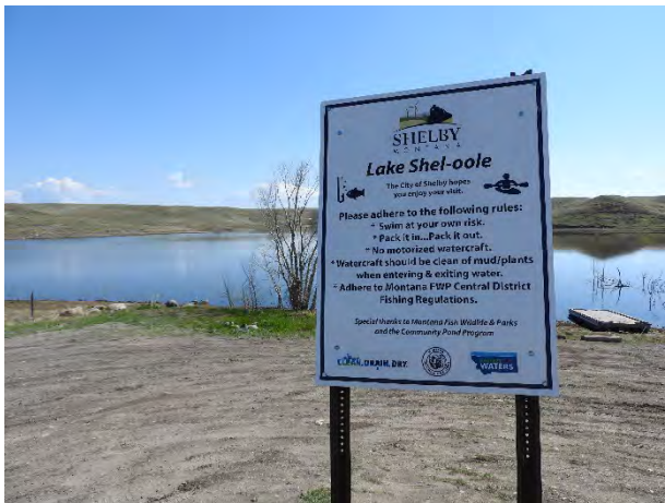
Below: Home Run Pond

Lake Shel-oolle is a 2-acre pond located near Shelby. Despite being only ½ mile north of town, the lake was never developed to provide better fishing access. The shorelines are rocky and have weeds, and access can be difficult. This project installed a floating dock to improve fishing opportunities. Kids fishing days are expected to increase with the improvement.