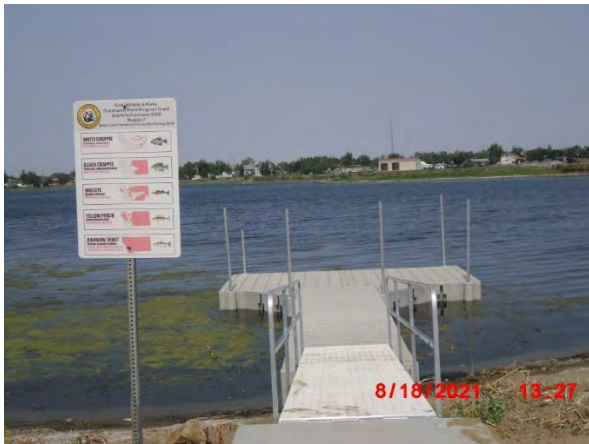
Below: Ike's Fishing Pond

Grant funding awarded (2020): $3,000 Project cost: $7,298.90