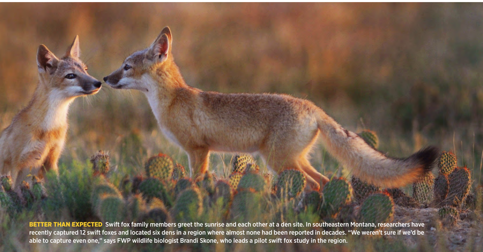
BETTER THAN EXPECTED Swift fox family members greet the sunrise and each other at a den site. In southeastern Montana, researchers have recently captured 12 swift foxes and located six dens in a region where almost none had been reported in decades. “We weren’t sure if we’d be able to capture even one,” says FWP wildlife biologist Brandi Skone, who leads a pilot swift fox study in the region.

radio or GPS collars and others with ear tags for identification from a distance.