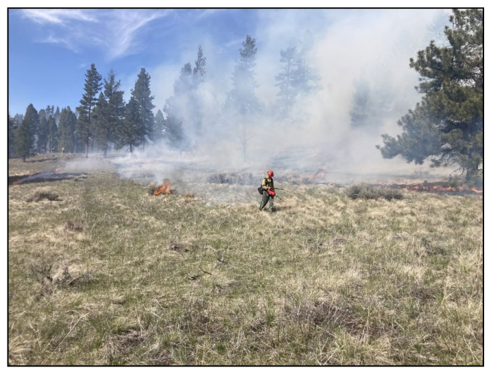
Figure 12 - Firing operations on Nevada Lake WMA, spring 2022.

FWP plans to burn 244 acres of stands previously treated with mechanical treatments. FWP contracted Brushbull Forestry (Florence) and Bull Creek Forestry (Seeley Lake) to construct firelines. To-date, 138 acres of broadcast burning has been implemented at a cost of approximately $56,817. Expenses have been paid for with grants from Blackfoot Challenge (Ovando), RMEF, and the Wildlife Division's Forest Management Account.