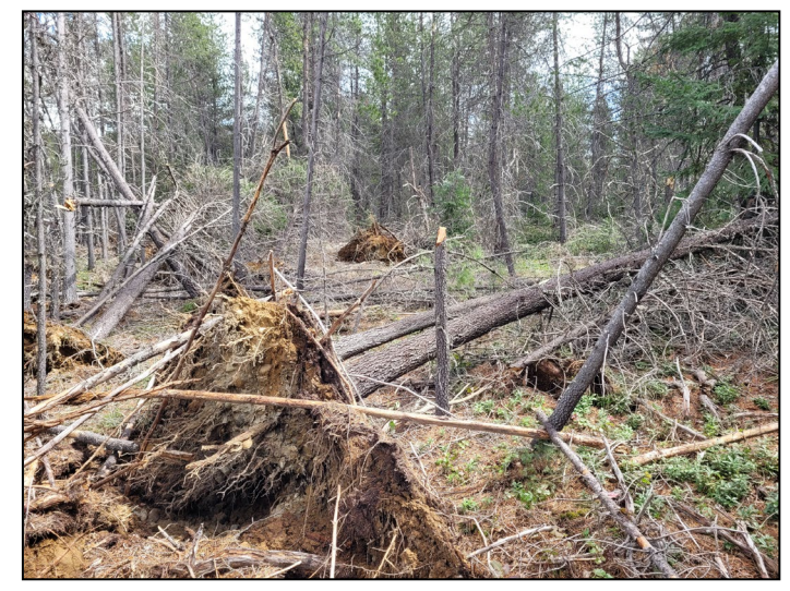
Figure 11 - A wind event in January 2021 damaged approx. 120 acres on the Bull River WMA.

In January 2021, a severe wind event impacted the Bull River WMA resulting in blowdown timber across approximately 120 acres of the 1,576-acre WMA. The Fish and Wildlife Commission approved FWP's proposal to remove the blown down trees in October 2021. The project objectives are to reduce susceptibility to bark beetle infestations, mitigate fuel hazard created from blown down trees, promote aspen growth and regeneration, and improve elk and deer movement and access to forage within the affected stands.