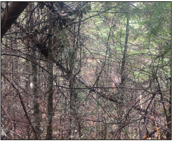
Figure 4 - Horseshoe Lake FAS prior to treatment, October 2022.

removed from the project because it was too steep for the contractor to operate on. The project cost $13,600 and was paid for using the Fisheries Division's Forest Management Account ($8,700) and a USDA-USFS Hazardous Fuels Reduction Grant ($4,900) awarded to Swan Valley Connections through Montana DNRC.