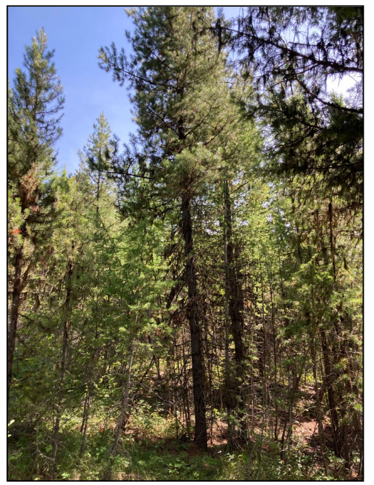
Figure 15 - The Doney project would treat young stands previously owned by Plum Creek Timber Company.

In August 2021, the Fish and Wildlife Commission approved FWP's proposal to treat 1,116 acres of the Calf Creek WMA near Hamilton. The objectives of the project are to improve elk and deer winter forage, restore grasslands through conifer removal, promote stand conditions that would allow fire to burn at a low severity appropriate for the habitat type, and promote aspen growth and regeneration. The project involves a combination of commercial timber harvest, noncommercial treatments, and prescribed burning. The estimated cost of all treatments is $300,000. FWP is pursuing grant funding opportunities for this project