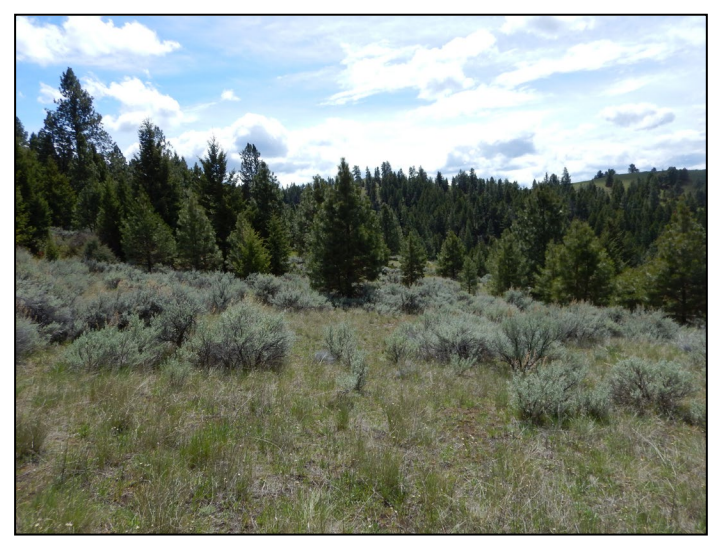
Figure 14 - Over the past 60 years conifers have gradually expanded into grass/shrublands on the Calf Creek WMA, reducing forage availability on elk and deer winter range.

and is coordinating the project implementation with the Bitterroot National Forest, who is also working to implement the Gold-Butterfly project adjacent to the Calf Creek WMA. The project could start in the summer of 2023, if funding can be secured.