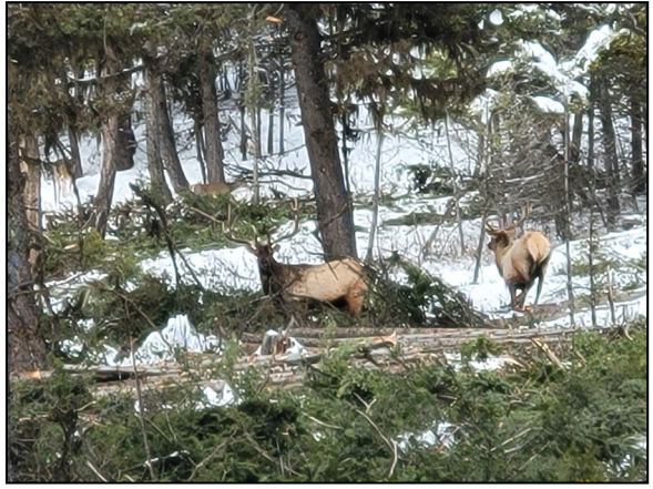
Figure 7 - Elk and deer foraging in active timber harvest operations, February 2021.

The Elk Basin Restoration 2 project is the second phase of the Blackfoot-Clearwater WMA (BCWMA) Conifer Expansion and Native Grassland Restoration Project that was approved by the Fish and Wildlife Commission in April 2017. The objectives of the project are to maintain and restore rough fescue/Idaho fescue grassland, ponderosa pine savannah, aspen habitats, and mixed-