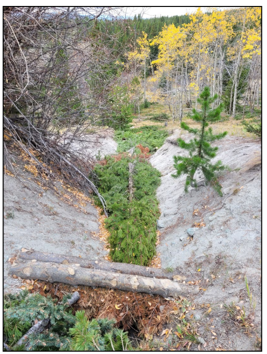
Figure 13 - Cut material from the adjacent aspen stand was placed in this eroded gully to reduce sediment transport into Oregon Creek, October 2022.

FWP contracted with Worman Forest Management, LLC to perform the hand-cutting and erosion control work. The project is 70.2 acres and will treat approximately 27,000 linearfeet of eroded gullies. The project will cost $41,067 and will be paid for with NRDP funds through an MOU between FWP and Montana Department of Justice. The contractor completed 30.4 acres in October 2022 and will complete the rest of the project in the summer of 2023.