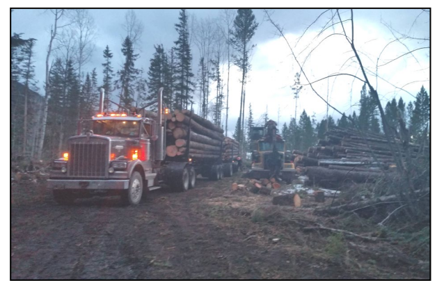
Figure 6 - Loaded log truck getting ready to head to Weyerhaeuser, January 2021.

caused significant blowdown on approximately 86 acres of the WMA, which had the potential to negatively affect deer and elk movement and foraging, recreational use, bark beetle activity, and potential fire intensity and severity in the event of a wildfire.