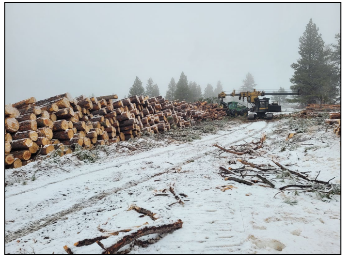
Figure 9 – Stroke-boom delimber processing encroachment trees from grass/shrublands to improve winter range. January 2022.

The Fish and Wildlife Commission provided final approval of FWP's proposal to implement the 1,492acre Threemile 2 Timber Sale project in April 2019. The objectives of the project are to improve native grass and woody browse forage production for elk and mule deer, restore a more desirable species composition and successional stage, reduce susceptibility of treated stands to bark beetle epidemics and uncharacteristic stand-replacement fire, and improve aspen habitats. FWP coordinated the project with