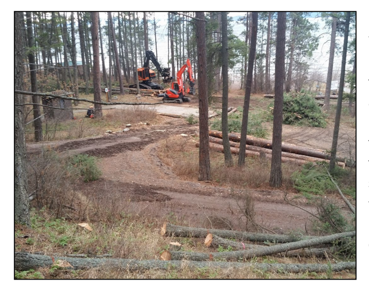
Figure 2 – LTL Enterprises, LLC operating near the boat launch on Wood's Bay FAS, January 2021.

In October 2019, the Fish and Wildlife Commission approved FWP's proposal to implement forest treatments on approximately 10 acres of the Wood's Bay FAS near Bigfork, MT. The objectives of the treatment are to mitigate hazard trees in the developed recreation site, reduce hazardous fuels in the wildland-urban interface (WUI), and increase resiliency to insects and diseases.