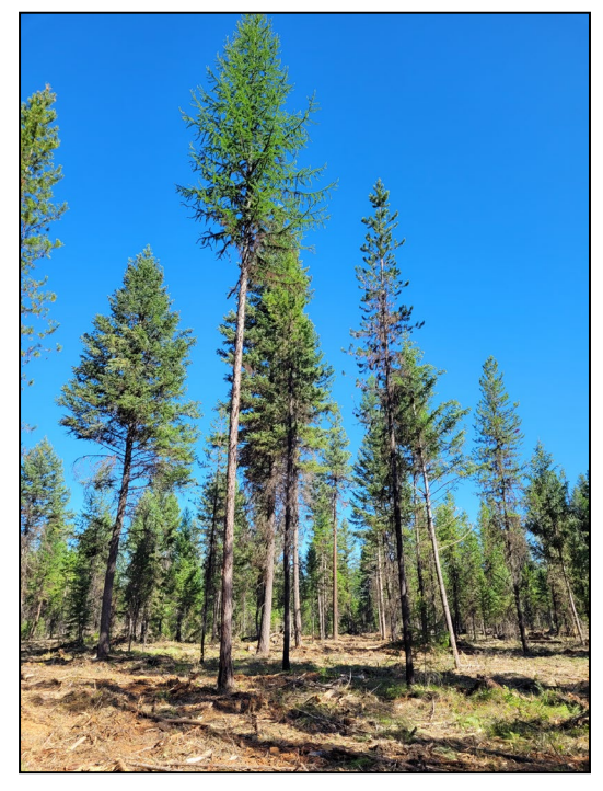
Figure 17 - The Cibid/Cad Lake fuels reduction project used a grant from Lincoln County requiring a 10 to 15 spacing between crowns to reduce the risk of crown fire. August 2022.

on 45 acres. FWP awarded a contract to Worman Forest Management, LLC to perform the work. The project was completed in December 2022. FWP will burn the slash piles in Fall 2023. The project cost $20,855 and was paid for using a USDA-USFS Forest Health Western Bark Beetle Grant administered by the Montana DNRC ($16,651), Parks maintenance account ($2,744), and FWP's Parks Division's Forest Management Account ($1,460).