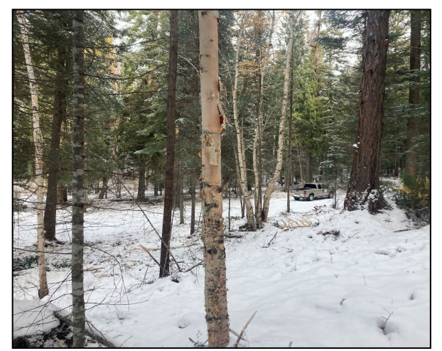
Figure 5 - Horseshoe Lake FAS after mastication treatment, November 2022.