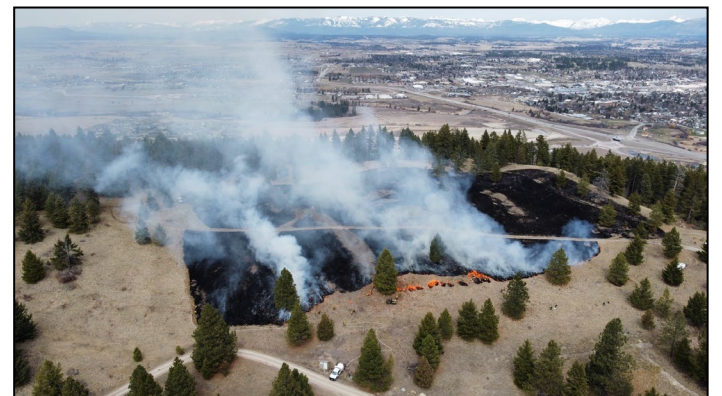
Lone Pine State Park Forest & Grassland Improvement Project

which was paid for using a USDA-USFS Forest Health Western Bark Beetle Grant administered by the Montana DNRC ($15,000) and Parks Hazard Tree funds ($4,950). FWP also hired a temporary worker to perform hand-cutting of non-merchantable trees. FWP staff, volunteers, and AmeriCorps also assisted with cleaning up slash and hand-thinning.