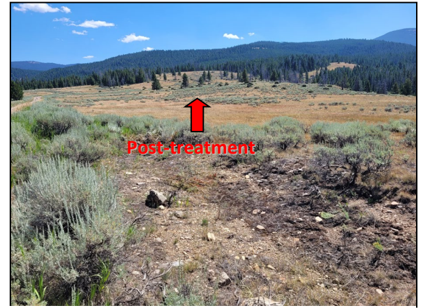
Figure 10 - Mt Haggin WMA Habitat Project #4/Phase 3. Pre- and post-treatment. August 2022.