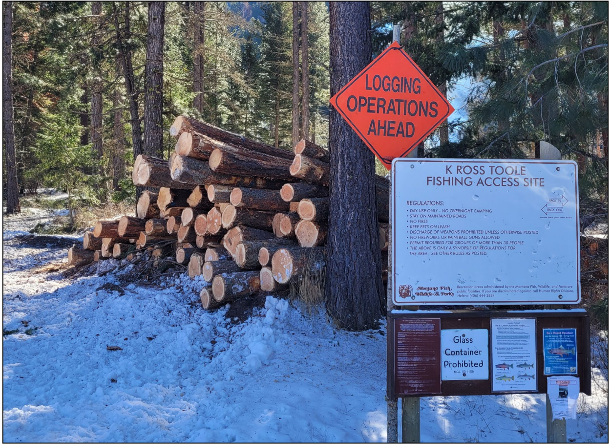
K. Ross Toole Fishing Access Site (near Bonner, MT).